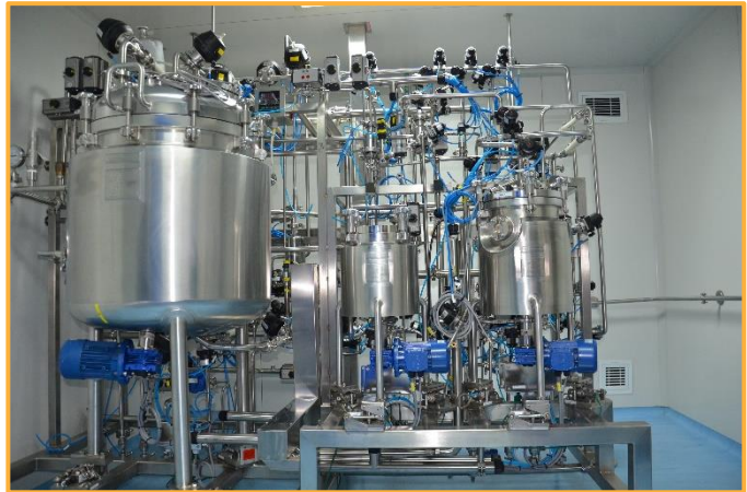
Formulation tanks with CIP/SIP