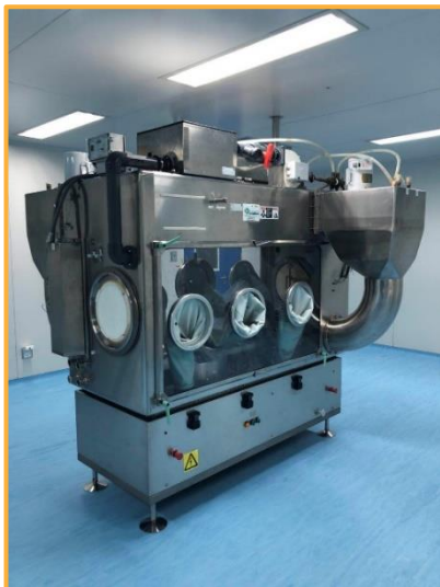
Isolator based vial filling and stoppering line