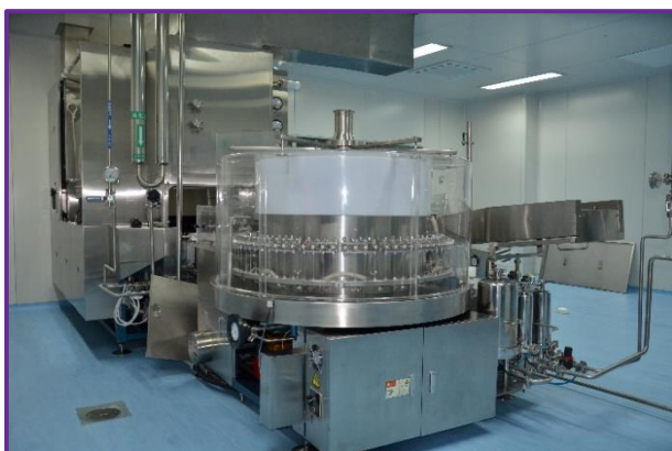
Depyrogenation ovens and washing for vial and ampoule lines