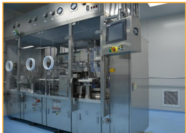
RABS based high speed ampoule filling line