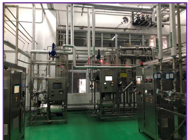
WFI, purified water and purified steam for all filling